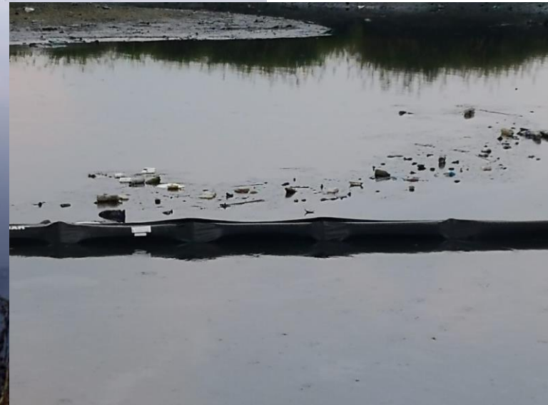
16 Apr 19: Deployment of solid floatation boom as 2nd line of defense to contain further oil